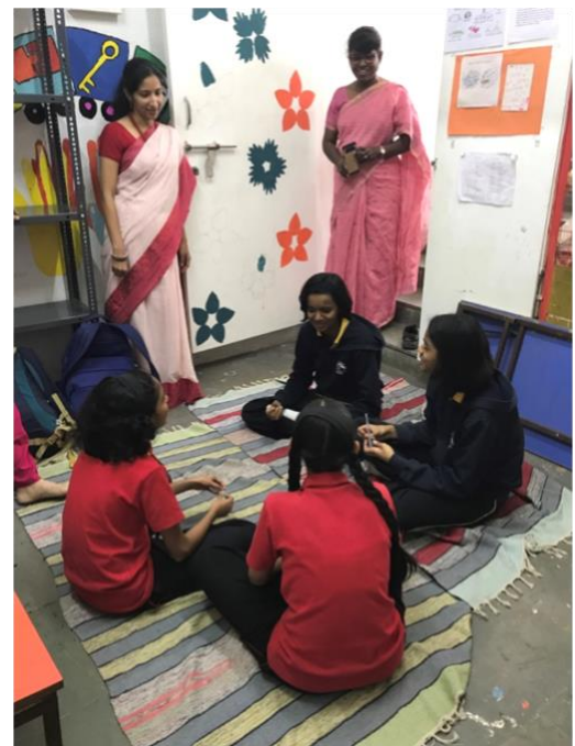
Gifted Education in the so called Gifted Katta (Gifted Corner)