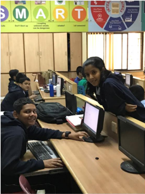
Lesson in the Computer Room

Thanks to the activity of Kaveri Gifted Center, the ethos of knowledge and the recognition of giftedness permeates the school atmosphere; this is a hard-fought and commendable achievement.